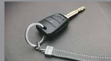
Keyless Entry & Central Locking