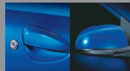
Body Color Door Handles & Mirrors