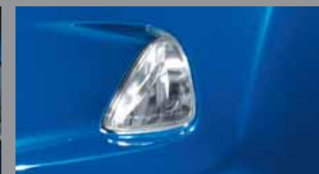
Front Fog Lamps