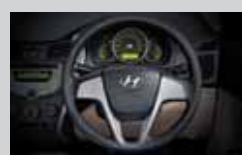
3-Spoke Steering Wheel