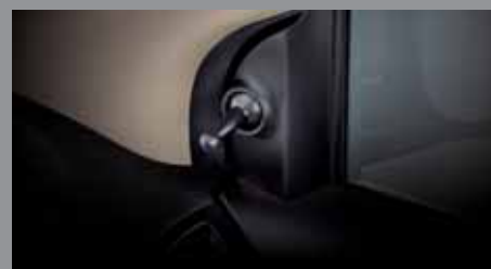
Internally Adjustable Outside Mirrors