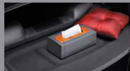
Rear Parcel Tray