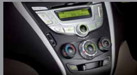
AC & 2 DIN Audio with Aux-in & USB Ports

When it comes to comfort or convenience, the Hyundai EON boasts of both in equal measure. It contains all the features you'll ever need, well designed and placed within easy reach.