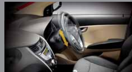
MDPS with Tilt Steering